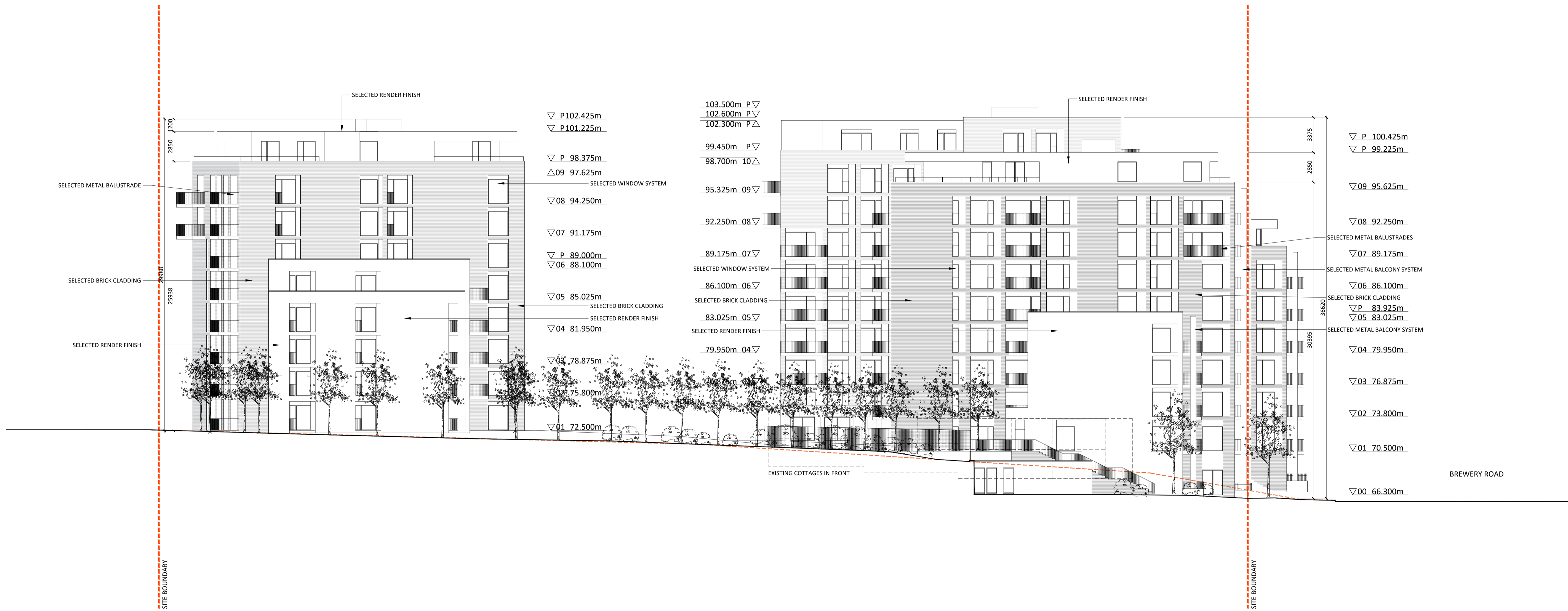
Northeast Elevation (Block M & J)